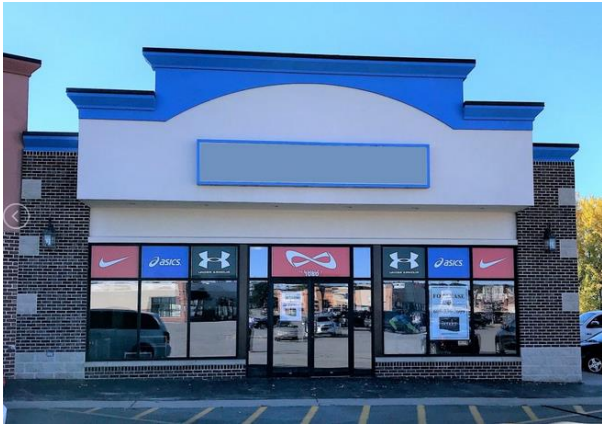
END CAP – 3,331 SF (P8)