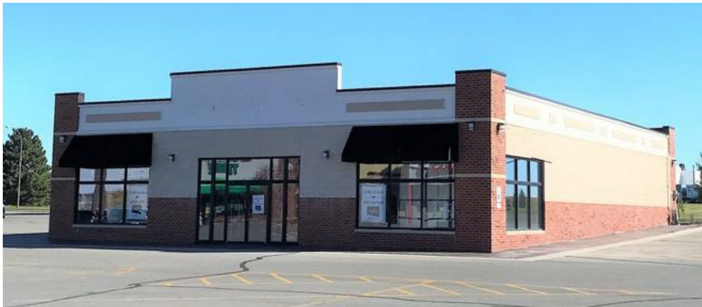
PAD SITE – 4,941 SF (S1)