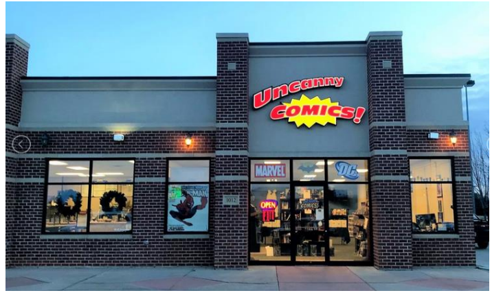
DRIVE-THRU – 1,781 SF (P2)